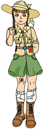
Bonnie Bandanna asks What's in your pack?

out if something goes wrong so make sure everything is perfect before you leave; people, vehicles and supplies. Click here for a Google map showing routes and directions.